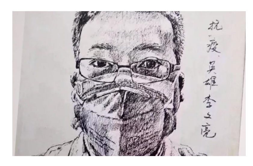
Chinese whistleblower Li Wenliang who issued an early warning that was suppressed by government authorities

The SARS-CoV-2 outbreak could have been contained early on and the vast majority of what followed could have been prevented. This did not happen explicitly because of false and fatal