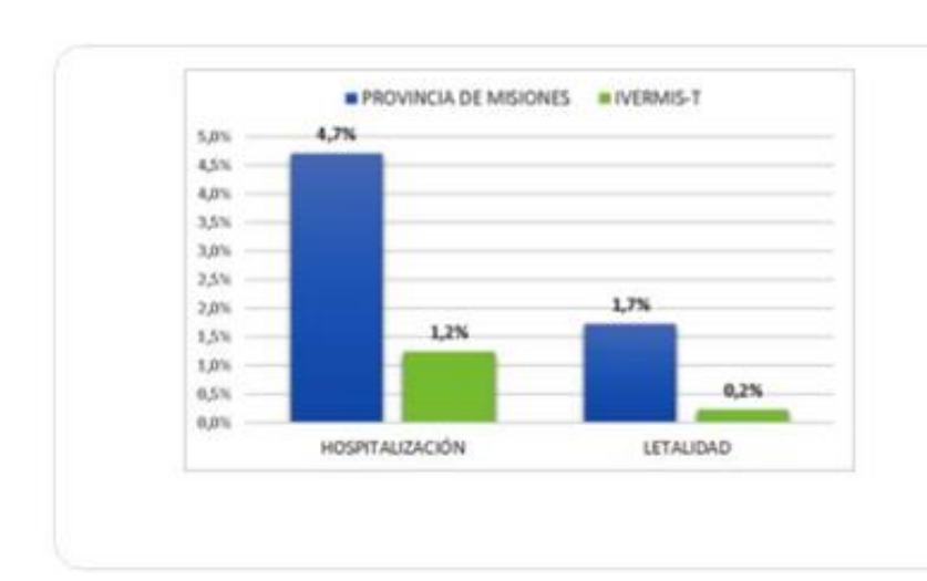
Graphic on the results of an early treatment program (green= early treatment, blue=no early treatment) by the Argentinian province of Misiones which concluded: "The incidence of hospitalization and deaths is considerably decreased in the population that followed the treatment".

Eventually, a number of renowned frontline physicians – from different parts of the world – reported successes in the therapy of COVID when treated early. These physicians, making use of their independent clinical judgement, were ahead of both the WHO and national health agencies. Respected frontline doctors developed and published safe and effective early treatment protocols (which mainly contained repurposed off-patent medicines), hardly losing any patients to the disease when